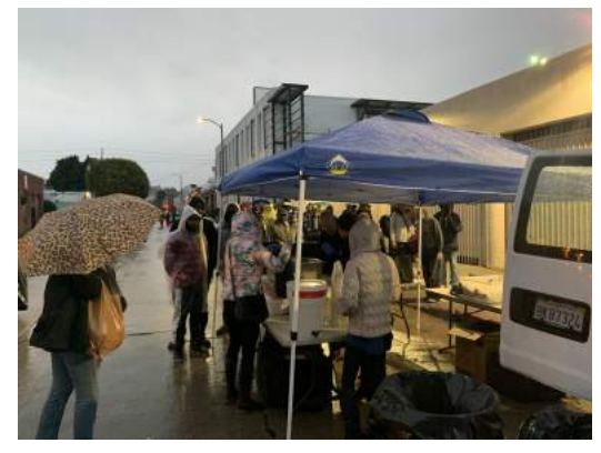
This past Sunday night's rainy meal meal service at our weekend street location.

Dear Hollywood Food Coalition Community,