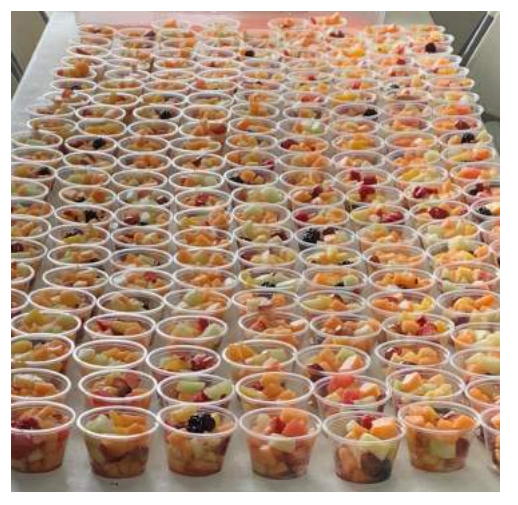
Fresh fruit ready to eat. We have always emphasized nutrition, which is needed now more than ever.

Everyone here at The Hollywood Food Coalition