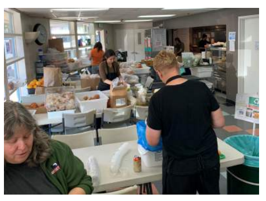
HFC now limits volunteers to no more than ten people in the kitchen.

We have found many of our clients don't really understand the seriousness of the COVID-19 virus and what they need to do to help keep themselves safe.