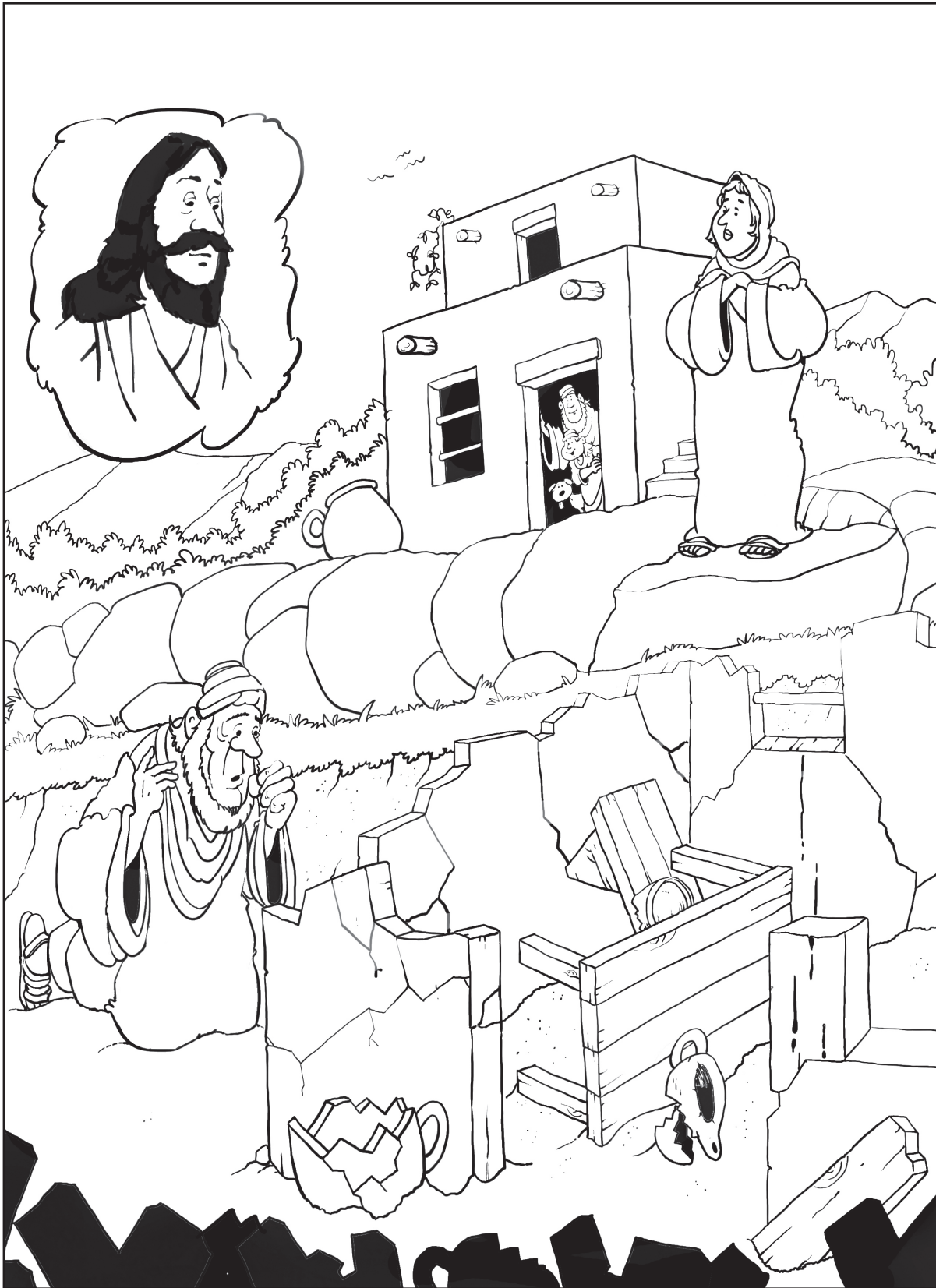
Jesus tells a story about two houses.