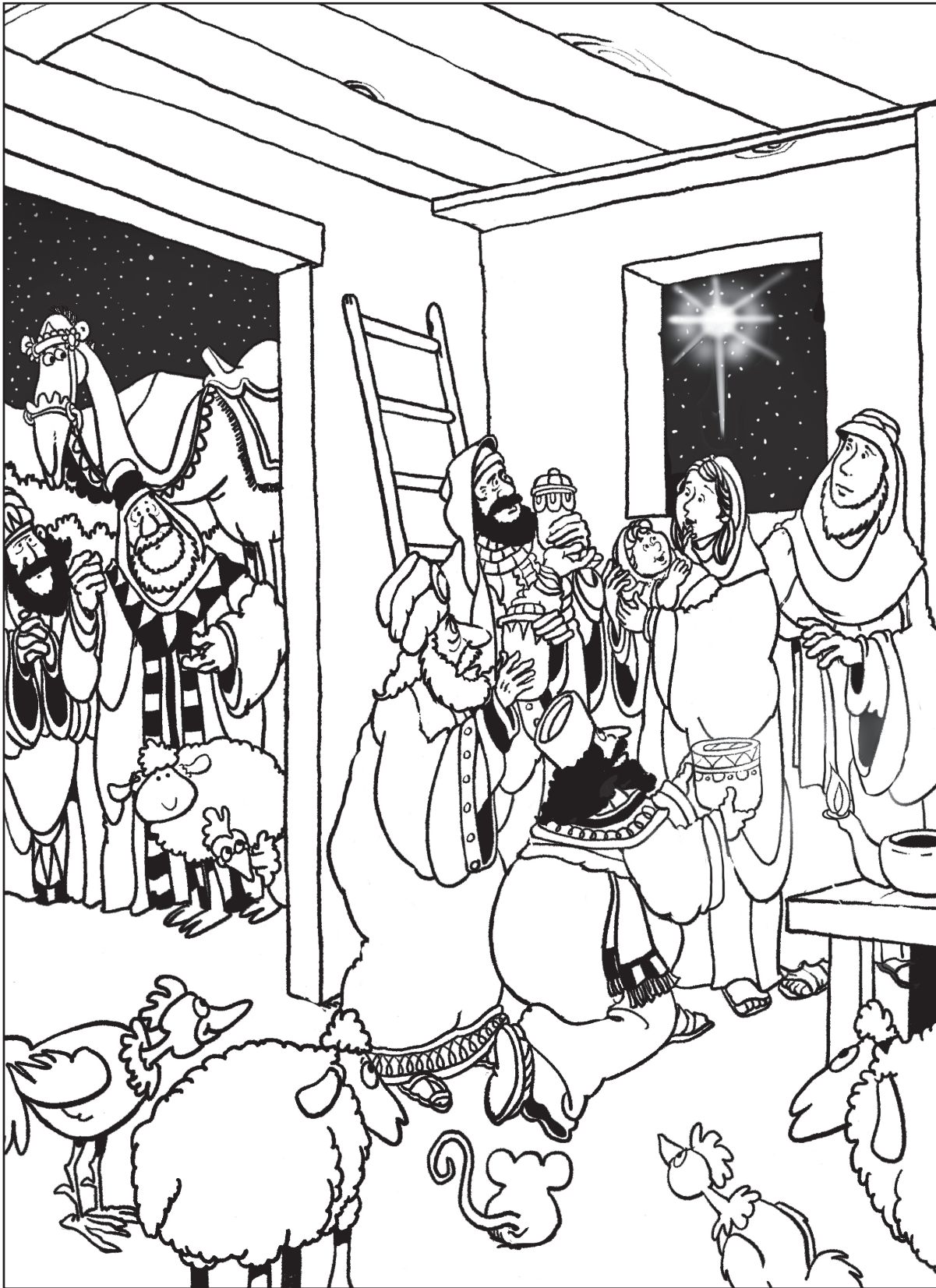
The wise men give gifts to the baby Jesus.