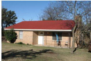
Gault fieldhouse 3433 FM 2843