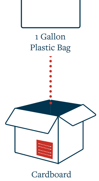
Box for Shipping