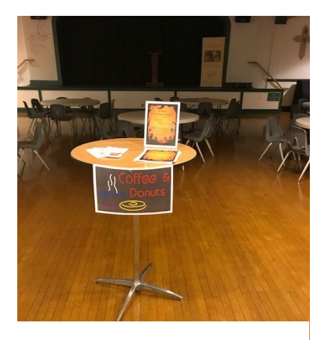
Welcome Table—For when there is anything to display. Table should be placed near entrance of School Hall